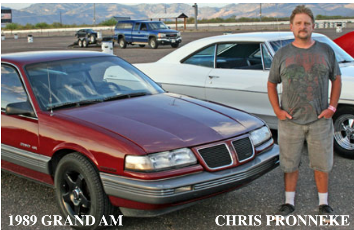
1989 GRAND AM