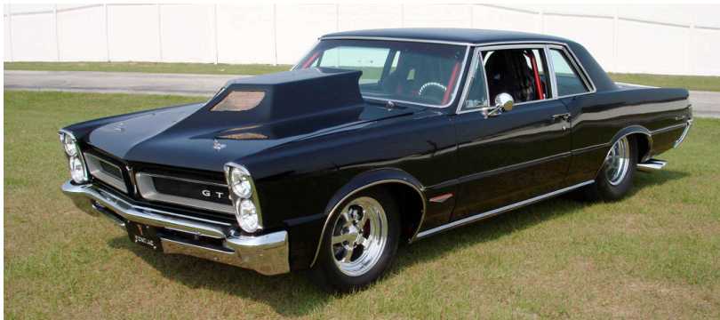
1965 GTO for sale